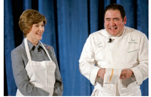
Mrs. Bush with chef Emeril Lagasse