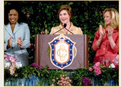
Mrs. Bush at the 2007 Congressional Club luncheon

"We know that many children don't have books in their homes,