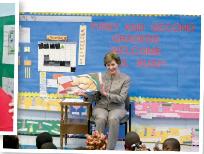
Mrs. Bush reads with students at Banneker Elementary School